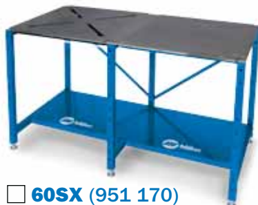
60SX (951 170)

Tabletop style 3/16-in solid tabletop 3/8-in combo tabletop Weight 230 lb (104 kg) 318 lb (144 kg) Dimensions 30 x 60 in (35 x 58 x 29 in) 30 x 60 in (35 x 58 x 29 in)