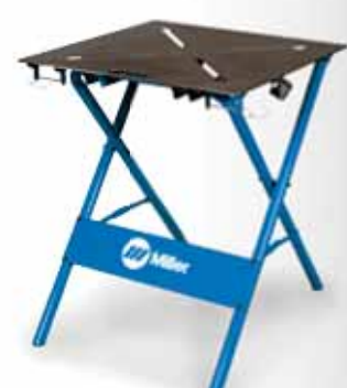
30FX (300 837)

Tabletop style 3/16-in X-pattern tabletop Weight 74 lb (34 kg) Dimensions 30 x 30 in (35 x 29 x 35 in unfolded, 6 x 29 x 48 in folded)