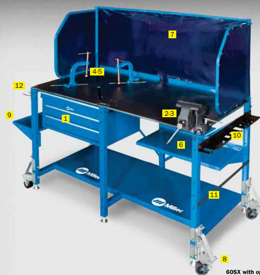
60SX with optional accessories