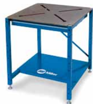
30SX (951 168)

Tabletop style 3/16-in solid tabletop 3/8-in X-pattern tabletop Weight 123 lb (56 kg) 177 lb (80 kg) Dimensions 30 x 30 in (35 x 29 x 29 in) 30 x 30 in (35 x 29 x 29 in)