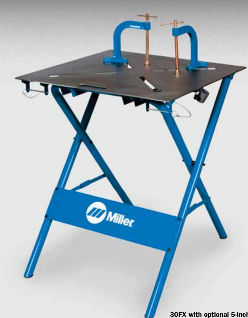
30FX with optional 5-inch X-clamps