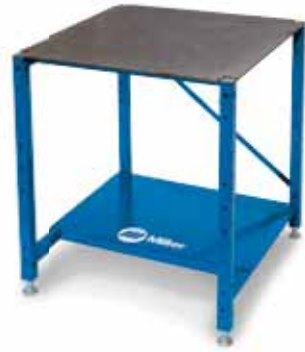
30S (951 167)