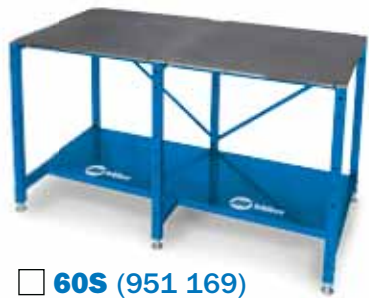
60S (951 169)

Tabletop style 3/16-in solid tabletop 3/8-in X-pattern tabletop Weight 123 lb (56 kg) 177 lb (80 kg) Dimensions 30 x 30 in (35 x 29 x 29 in) 30 x 30 in (35 x 29 x 29 in)